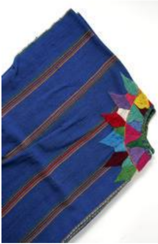
Fig.5: Guatemalan shirt, 1970s

Cotton, fabric woven in bands and blanket-stitched together 70 x 58cm(h)