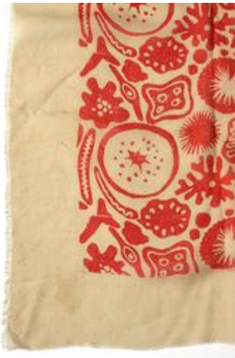
Fig.24: Silk square with repeating design of sea creatures, 1930s

square (already dyed green). The cloth was then boiled up and the dye bled out where it had been printed yielding a paler pattern. Marianne de Trey also experimented during her degree with simple tie dyes where knots tied tightly in the cloth prevent penetration of the dye, so reserving parts of the design ( Fig.27: Tie-dye textile ). These negative methods of creating graphic effects resonate with the wax-resist and sgraffito strategies that de Trey has so frequently utilised on ceramics.