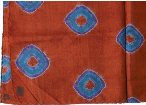
Fig.27: Silk with tie-dye pattern