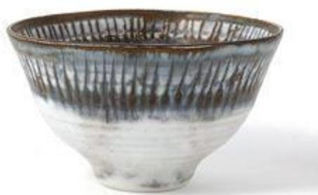
Fig.39: Bowl with sgraffito border of vertical lines, >1980

We have seen the self-discipline de Trey imposes in her spare palette of pigments and the reworking of decorative schemes over and over. What is less immediately obvious is that the maker generally restricts herself to two clear glazes. One is a conventional shiny feldspathic glaze; the other contains the element barium and makes the surface impermeable but is matt in appearance ( Fig.39: Bowl with sgraffito border of vertical lines ). 121 An example of how de Trey's pared-down repertoire of materials can give rise to the new and unexpected is found in a large oblong dish ( Fig.40: Oblong platter with floral design ).