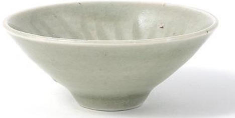
Fig.15: Celadon bowl, post 1980 Porcelain, thrown, gas-fired (reduction) 8.0 cm(d) Crafts Study Centre, Farnham 2004.175

This is a later example of de Trey's work in this medium made after she retired from the production pottery. The bowl was thrown and decorated inside with carved flutings radiating out from the centre.