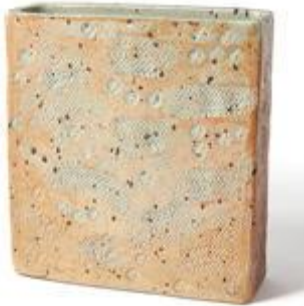
Fig.23: Rectangular vase with impressed motifs, 1970s, celadon-glazed

I have always been primarily interested in domestic wares and I enjoy designing and making functional shapes ... Through circumstances rather than choice I employ three assistants and still hope that one day they will run the pottery so well that I can relax and confine my attention to creative work. My present interests include small porcelain pieces and large slab built lamps ... As well as tableware I have designed a series of shapes for flower arrangements. I am still evolving new ones. 91