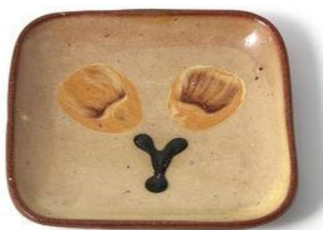
Fig.12: Square mould-made dish, 1950s earthenware, press-moulded, electric kiln Cup: 9.5 cm(w)

Indeed de Trey clearly enjoyed originating the designs and the pottery began to turn out a wide range of moulded dishes of all sizes from little dishes to large serving platters ( Fig.12: Square moulded dish ). In fact the pottery became known for one-off moulded dishes! These sizeable oval or triangular plates, freed from circular symmetry, were decorated by de Trey herself with freely-painted motifs such as a fish or a cockerel. 46 It is apparent that de Trey's personal aesthetic inspiration has been enabled rather than diminished by this technically practical measure. Moulded platters continue to be a strand of de Trey's work today (see Fig.40 ).