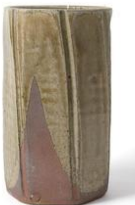
Fig.14: Cylinder vase, with faceted and grooved sides, 1970s Stoneware, thrown, cut, and grooved, wood-fired (reduction) 20.0 cm(h)

A year or so later [~1962] we built a small oil-fired kiln for my personal work. To diversify in this way makes life more exciting but is stupid from the business point of view and when in 1965 we built a wood-fired kiln, I might have been accused of gross self-indulgence. 70