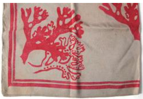
Fig.4: Silk square with seaweed motif, 1930s

In the Oriental school applied decoration was generally limited to calligraphic brushwork which was suggestive rather than illusionistic. 20 Marianne de Trey's polychrome tablewares with naturalistic motifs vibrant against a white background, which flirted with the style of domestic china, were unorthodox in this respect. A recent gift to the Crafts Study Centre from Marianne de Trey includes a selection of pots spanning her career alongside examples of student work made in printed textiles at the Royal College of Art in the 1930s ( Fig.4: Silk square with seaweed motif ). The gift also incorporates collected textiles gathered locally and internationally ( Fig.5: Guatemalan shirt ). This body of work enables threads to be drawn out that go back beyond when Marianne de Trey met Sam Haile. Above all pattern and decoration emerge as a central preoccupation of her creative work.