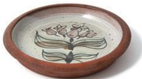
Fig.10: Cup and saucer, pattern 5, 1960s-1970s

Raw body given a moderate biscuit-firing, then covered with a white glaze (opacified with tin) and decorated with pigments containing copper, manganese, and iron oxides; the glaze and decoration matured in a second, high-temperature firing. Note the terracotta red of the wide unglazed rim - these small dishes were made in quantity and fired face-to-face; the bare clay rims don't fuse.