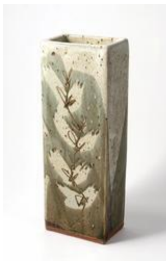
Fig.18: Rectangular vase with foliage motif

The economics of wood-firing are hard to work out; it is cheap in terms of fuel but very expensive in terms of labour; we get a high proportion of 'seconds' but the 'firsts' are far superior to the products of either electricity or oil. The satisfaction and the frustration are greater too - how must one balance these factors? I have to admit that without the steady production from the electric kiln I should find it hard to justify this whole project. 76 The same factors that make wood-fired pots sensually rich increase the difficulty and the failure rate of the firing, above all consistency and predictability are sacrificed. Using wood as the combustible material introduces some direct effects of the fire into the kiln - flying ash and a directional airflow as the flame generates a draught which draws the heat over the pots.