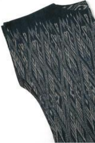
Fig.34: Ikat shirt, Indonesia, 20th century

Batik is a wax-resist process where a design is marked out in hot wax on the cloth before dyeing, reserving these areas. In fact the prominence of resist processes among the items gathered by de Trey is striking. When questioned about parallels with her ceramic design methods de Trey responded affirmatively. I think this whole idea of using some sort of resist whether it's wax or gums or even just tying things so the dye doesn't penetrate, they're all of a piece really, and the knowledge of the dye you're using is crucial. ... these things are what makes it all so fascinating; and the process of 'resist' I was playing about with in textiles is a technique I've used since in all my patterns on pots - stoneware and porcelain. 106