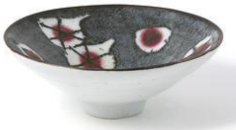
Fig.36: Flared bowl with grey and red star-like motif, >1980, top view

First of all the white spots in the design were reserved in wax resist and the dark 'spokes' in the motif scratched back through the wax. Then the whole inside of the bowl was painted in a slip bearing manganese and iron oxide and possibly some cobalt oxide (penetrating the sgraffito lines) which here fires a dark lustrous gray. Then the bowl was clear-glazed and a spot of copper-pigment was placed in the white areas and this fired under reduction giving the deep red colour.