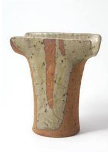
Fig.21: Shoulder vase, post 1970s

Stoneware, thrown, altered, and constructed, wood-fired (reduction)