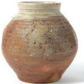
Fig.19: Round vase with impressed decoration, 1970s

Well, that was wonderful, there were things that turned out as you hoped they would and things that got stuck together and things that fell off the roof. 80