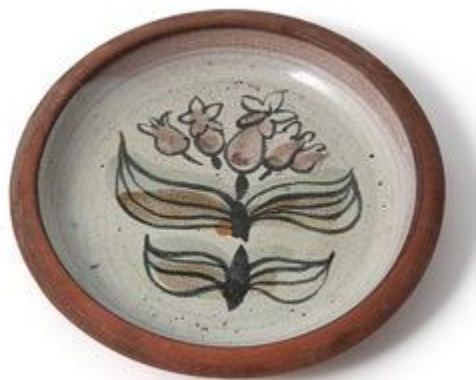
Fig.2: Plate painted with floral motif, top view, 1950s Tin-glazed earthenware, thrown, electric kiln 12.7 cm(d)