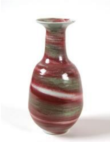
Fig.1: Agateware bottle, 2003